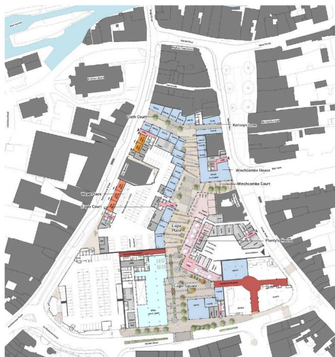
Figure 1: Emerging masterplan proposal as presented to the Town Council on 9 th October 2020