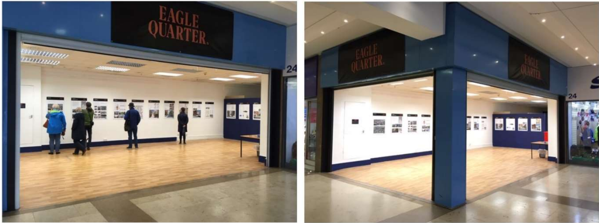
Figure 3: the public exhibition that ran for two weeks in Autumn 2020